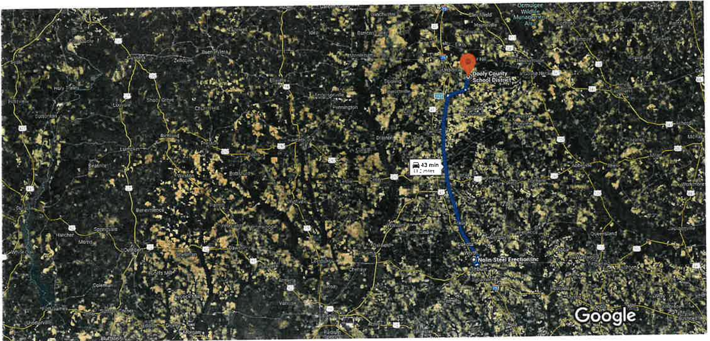
Imagery ©2024 TerraMetrics, Map data ©2024 Google 5 mi

Nolin Steel Erection Inc 1951 US-41, Ashburn, GA 31714